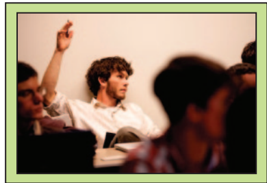
Faculty engage students interactively on a wide range of topics in medical science and practice.