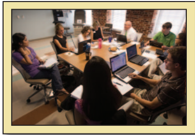
With facilitator guidance, students work in teams through cases to discover knowledge from biological and clinical sciences.