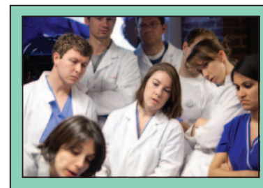
Students work in teams to learn human anatomy through cadaver dissection.