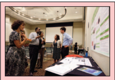
Students put the principles of public health into action through collaborative projects with community partners.