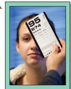
Under supervision of experienced clinicians, students learn how to interview and examine patients.