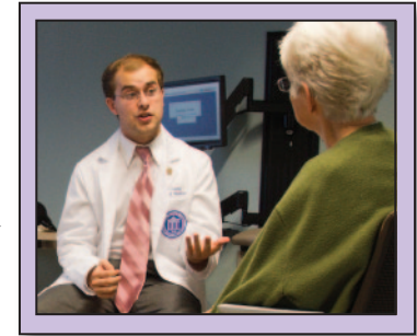
Students study the knowledge, attitudes, and skills for developing excellence in doctoring.