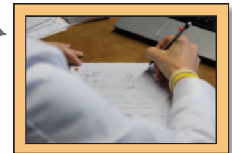
Students check their achievement of the learning objectives with standardized tests that integrate the week's material.