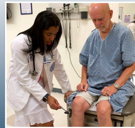
▲ Each of the 15 exam-style rooms is equipped with top-of-the-line technology typical of real hospitals and physicians' offices.

Some encounters require a training session prior to the event. These training sessions include discussing the case, and possibly a video review of previous SP-student encounters or role playing. In addition, SPs are provided instruction on how to assess and offer feedback on medical students' abilities to interact with patients. In testing or graded situations, SPs complete student evaluations based on the specific set of skills being assessed. SPs will also be trained in basic anatomy, as well as basic history-taking and physical exam skills.